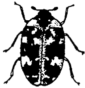
Carpet Beetle (—)