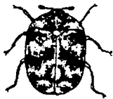
Varied Carpet Beetle (—)