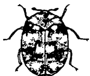
Furniture Carpet Beetle (—) actual size